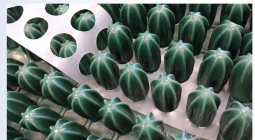
Connector Strip used to join two or more inserts

This information provides general guidance. EMP recommends specialized sleep surfaces be selected with the help of a qualified medical professional.